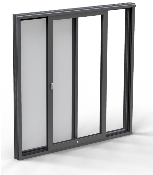
INTERNAL VIEW (half open position)