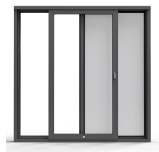
INTERNAL VIEW (half open position)