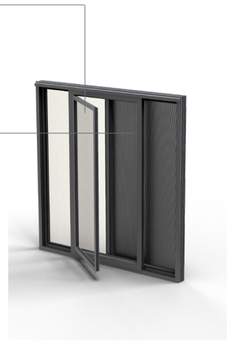
EXTERNAL VIEW (with Access sash in open position for cleaning)

Single piece of hardware which does the job of a winder, patient thumb lock and staff lock.