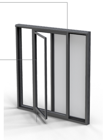
EXTERNAL VIEW (with Access sash shown in open position for cleaning)

To maximise light, reduce sightlines and provide enhanced thermal properties.