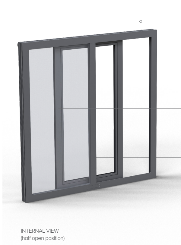
INTERNAL VIEW (half open position)